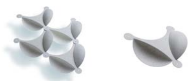
MEMBRANE Acoustic panel / Room divider By David Trubridge